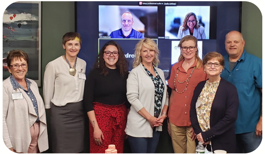
2022-23 Community Investment Committee

The United Way of South Central Massachusetts (UWSCM) 2022-2023 campaign was an exciting year as it also coincided with our 85th Anniversary. The Finance Committee is focused on maintaining financial transparency, accountability, and maximization of our overall impact to the community. In order to meet the needs of our community, we set an ambitious goal of $584,000 for our organization. I'm proud to announce that we were able to not only meet but exceed this goal by raising over $615,000! In addition to this, we managed and allocated more than $298,000 to local school districts and local after school and out of school programs. At the close of our fiscal year, the UWSCM remains in a financially strong position. Assets increased by nearly 11% to a total of $1,077,000, while our liabilities remained relatively flat at $56,000. With the continued generosity of our donors and volunteers, the UWSCM is in a great position to continue serving our community for many years beyond this 85th milestone.